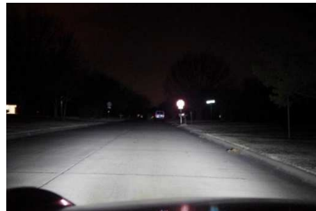
Litezupp L7NP LED Bright