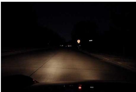
Sealed beam Halogen Bright